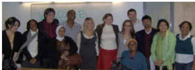
(above) Students at Tulane University pose with IVLP Grassroots Democracy participants. The group was in New Orleans for six days.

In mid-November, a group of 14 IVLP participants arrived in New Orleans to learn more about